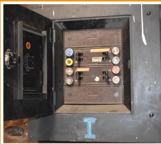
The plan calls for updating or replacing electrical systems.

Keeping Arlington schools in good condition for student learning is crucial, especially with schools ranging in age from 20 to 90 years old. Like homeowners who periodically need to replace roofs and furnaces after years of wear and tear, Arlington schools need fixes to critical infrastructure. Many buildings have original electrical systems, not designed to meet the existing electrical loads. Five schools need roof replacements, and some need improvements to ventilation and drainage systems. Other important projects in the bond proposal include replacing doors, flooring and casework, asbestos removal, and sidewalk and pavement improvements.