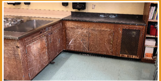
Replacing classroom cabinets and floors where needed will help keep schools in good working condition.