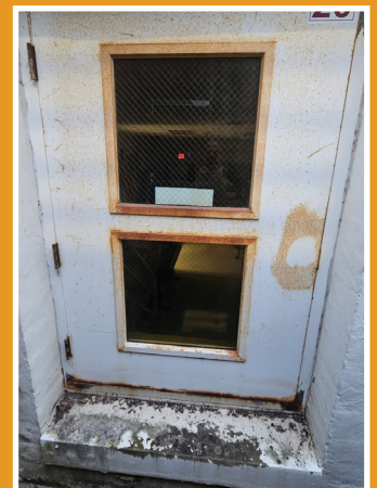
Many doors throughout the district are old and need to be replaced.