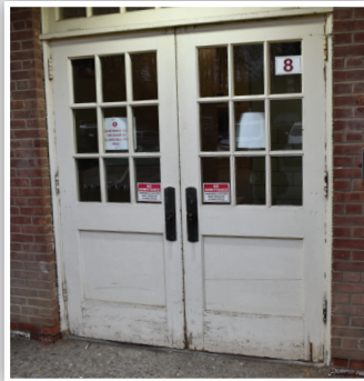
Replacing original exterior doors where needed will improve security at schools.

All visitors must be screened and pass through the main entry before entering the school. We will also improve safety by replacing aging exterior doors at several schools and improving the traffic flow during pickup and drop off times at Arthur S. May School.