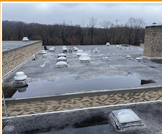
Roofs are in need of repair at many schools including LaGrange Middle School.